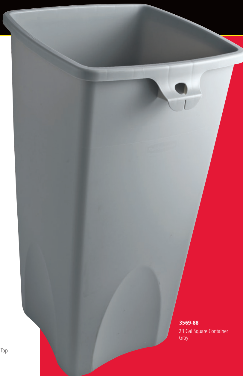
3569-88 23 Gal Square Container Gray

Patent-pending liner cinch allows easy one-step can liner retention and eliminates knot tying.