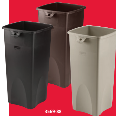
3569-88 23 Gal Square Containers Black, Brown, Beige

Recycling Label Kit Optional Recycling Label Kit includes one set of 11 color-coded symbol labels and three sets of 11 word labels in English, Spanish, and French.