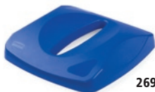
2690 Paper Recycling Top