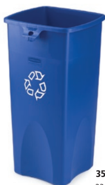
3569-07 23 Gal Square Recycling Container