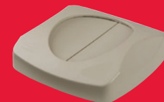
2689-88 Swing Lid Beige