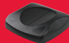
2689-88 Swing Lid Black